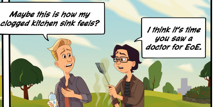
Dramatization of symptoms